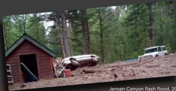
Jensen Canyon flash flood, 2007

Teton County has the highest danger from landslides in Wyoming. Fortunately, most occur in areas that are uninhabited, but may still affect transportation routes into and out of the valley. Landslides are typically triggered by unusually high rates of rain or by an earthquake. In 1997, the Snake River Canyon was closed for 6 weeks by a landslide. Lower Slide Lake northeast of Kelly was formed by a giant landslide in 1925. In 1927, the dam created by the slide suddenly failed causing major flooding in Kelly and throughout the valley. When building, avoid construction in steep-slope areas. If you live on or near the base of a steep slope, you might consider getting an evaluation of the danger from a geotechnical consultant.